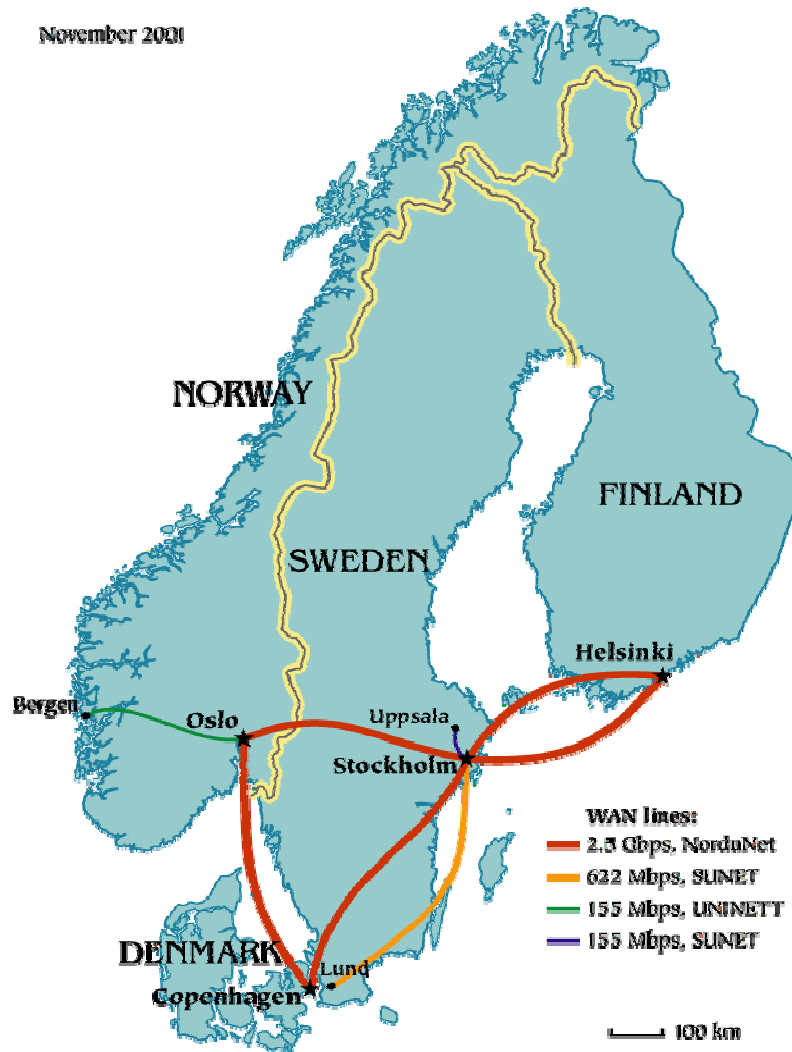
Figure 1. Connectivity map of the NorduGrid participating sites

Computing resources are fairly heterogeneous, hardware- and software-wise. Most of the processors are various types of Intel Pentium. Operating systems are various flavors of Linux: different distributions of Red Hat, Mandrake, Slackware and Debian. On test clusters, resource management is currently performed via OpenPBS.